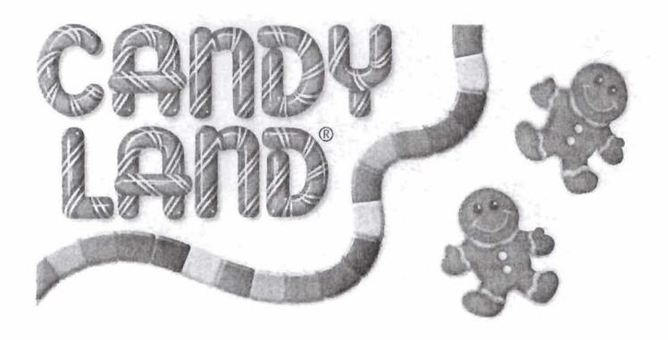
For 2 to 4 Players / AGE 3+

Welcome to Give Kids The World Village CANDY LAND... a place of sweet adventure. Come and visit some very special friends. Travel the path and stop along the way to explore Claytonburg Park of Dreams, the Gingerbread House, the House of Hearts, Amberville Train Station, the Ice Cream Palace, Marc's DinoPutt and the Castle of Miracles. As you go, don't forget to visit fun-loving Mayor Clayton, Ms. Merry, The Star Fairy and Rusty. Follow your heart...it knows the way.